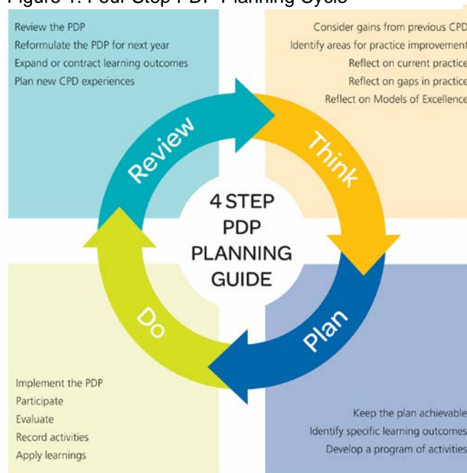
Figure 1: Four Step PDP Planning Cycle

The Think-Plan-Do framework (Figure 1) involves initial reflection on the expectations of the ATCAP program, but also your own strengths, experiences, shortfalls, and past feedback. You should think about what experiences might enhance your development as a child and adolescent psychiatrist, any specific learning outcomes you want to achieve and define what activities (including but not limited to those required of your training) might assist you to achieve your goals. Once formulated the LDP is a written record of the program of activities with a timeline for completion over the year. Once the LDP is complete you then implement the plan, keep the records and evaluate the outcomes on your